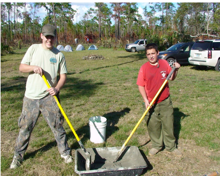
The candidates repairing fire pits

At the conclusion of the weekend the revved Paldani and Nok-Su Chapter's gave the Interfaith Worship Service soon followed by the business meeting and Chapter work projects. The bottom line, if you weren't there than you really missed out on a time of fellowship and Brotherhood!