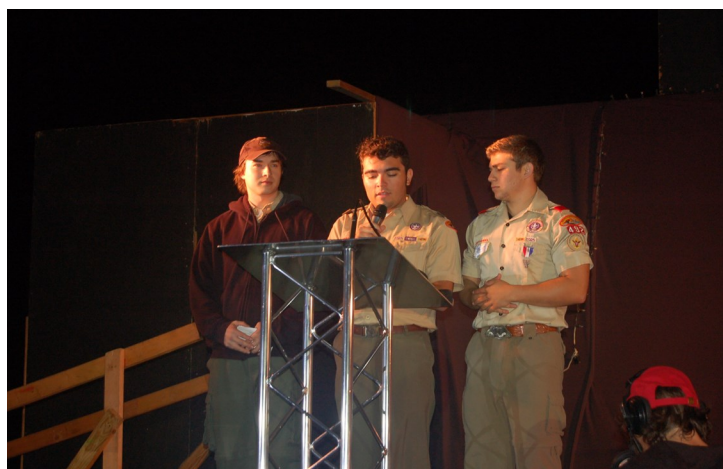
Arrowman holding a Closing Cer-

Early on Saturday morning, activity was furious as everybody was busy preparing for the opening of the village. The Lodge Camp Promotions team set up a great Camp Promotions Theater and a Philmont exhibit. There was an information booth and a booth where arrowmen could pay for their Lodge Dues on site and also register for the Lodge Banquet. Our Lodge historical display was set up showing off a lot of our great Lodge history and in case anyone did not see the signs that were set up telling everyone that this was the OA Indian village, the tepees certainly did. We had an Indian museum, costume displays, Indian games and of course, the dance arbor. Once the village opened it was jammed! Cub Scouts, Boy Scouts, family members and visitors kept coming and staying all day. There was a lot for them to see and do. The Lodge Drum Team played and sang during the day. The Indian museum was