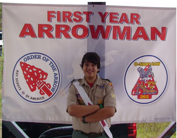
Pre-Ordeal Ceremony Friday Night