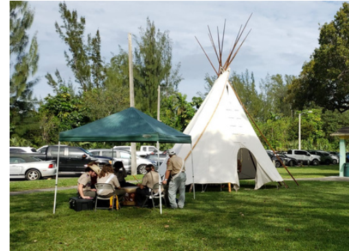
Indian Village at Lincoln Marti

Finally, remember to pay your dues if you have not, scan the QR code on the back and follow the instructions to pay online.