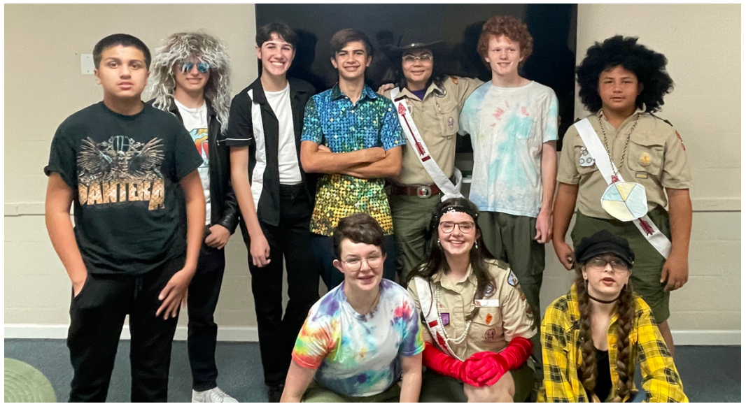
JANUARY MEETING DRESS UP FROM ANY DECADE