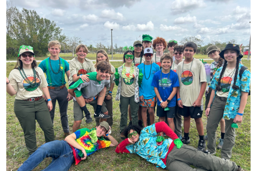
Pa-ha-yo-kee Pride at Lodge Banquet

This past month we had our O-Shot-Caw Lodge Banquet . Our Chapter did very well in Volleyball, and got second place in the Golden Arrow Spirit Award. This year we won fourth place with our rooms in the Haunted Forest, but don't let that get you down because all the Scouts involved set up some very nice rooms with a lot of effort put into them. If anything, this is an incentive to work even harder next year and win that prize!