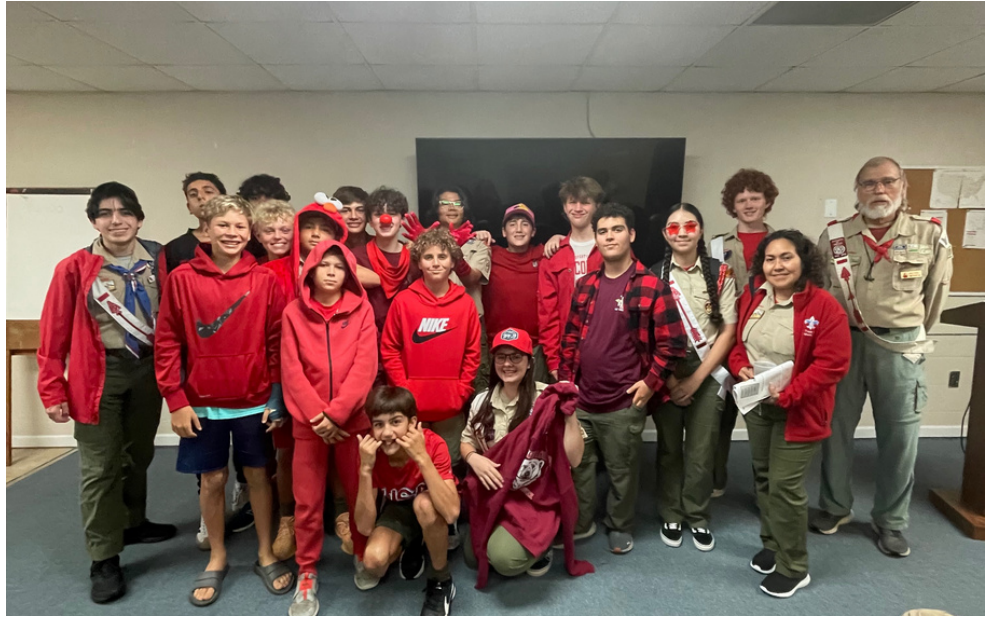
FEBRUARY MEETING DRESS UP: VALENTINE'S DAY